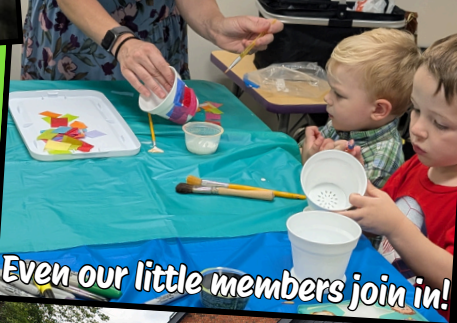
Even our little members join in!