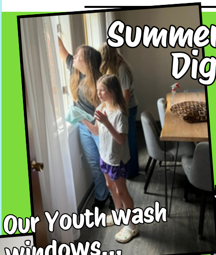
Our Youth wash windows...