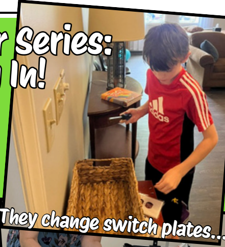
They change switch plates...